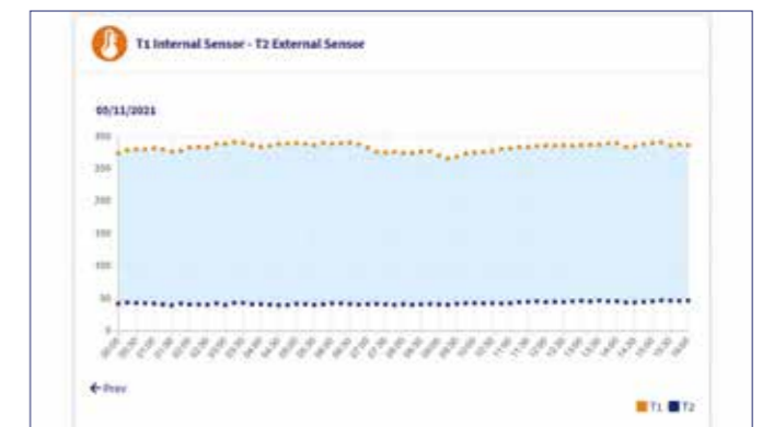
Thermal measurement: Temperature trend inside and outside the insulation